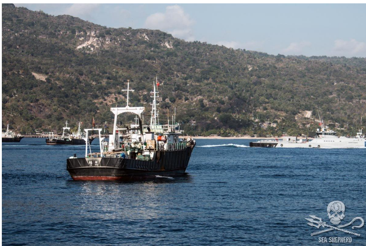
The M/V Ocean Warrior with the Fu Yuan Yu fleet off the coast of East Timor.

Mahein Nia Hanoin Nú. 15, 22 Novembru 2017